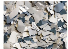
Hazy Blue (FB-807)