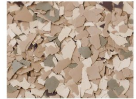
Desert Stone (FB-504)