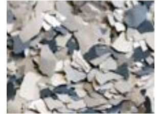
Hazy Blue EUA-335