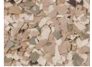
Desert Stone EEE-446